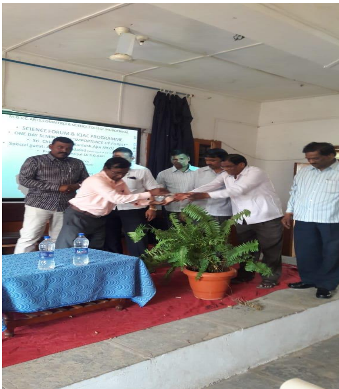
Figure 3 Inauguration by Chief Guest, Principal, Administrator and Secretary